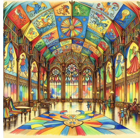
Fig. 4 An example output of the system, the tournament hall. Generated with OpenAI's DALL-E [11].

This leads to the following actions: Jousting and