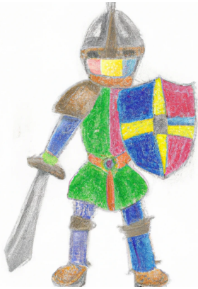
Fig. 3 An example of a user drawing. A drawing of a knight, generated with OpenAI's DALL-E [11].

The user draws a character on a piece of paper, and the system scans the drawing using a webcam (Fig. 3).