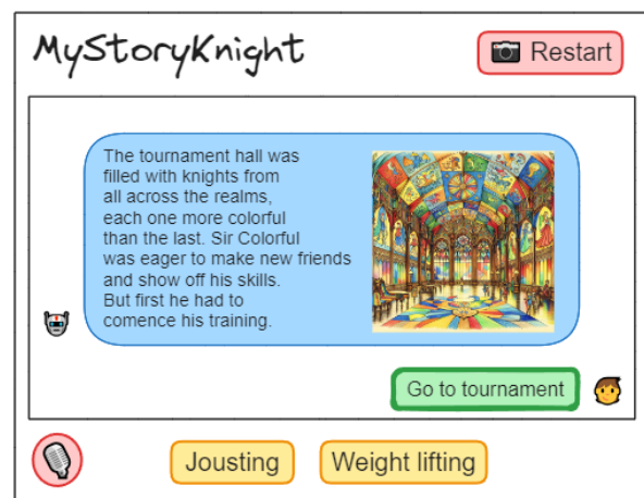
Fig. 2 Mockup of the user interface.

The user interface is shown in Figure 2. The main interaction screen consists of an action selection area (bottom), a restart button (top-right), a microphone indication toggle (bottom-left), and a story output panel (center).